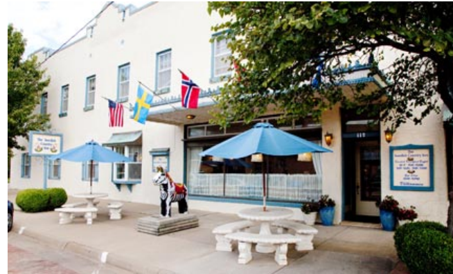
Lindsborg's Swedish Country Inn features Swedish-style breakfasts. Settled by Swedish immigrants in 1869, the town is the home of Bethany College.