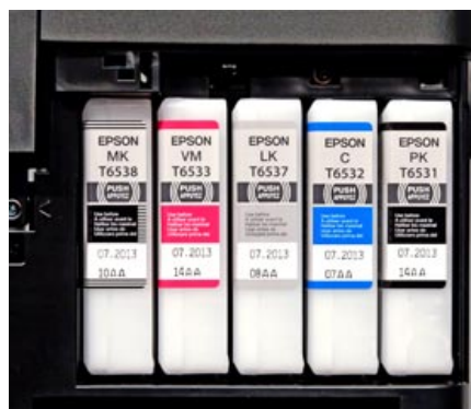
Right ink compartment with five HDR cartridges.